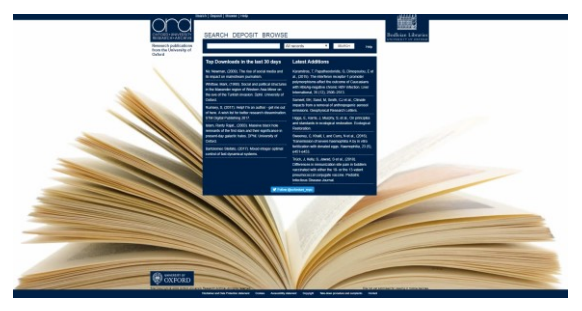
Oxford University Research Archive