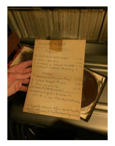
Some items were labelled, many blank – metadata had not been invented!