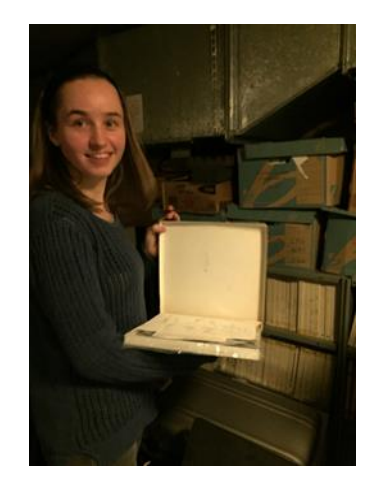
Reel-to-reel tape in need of 'baking'