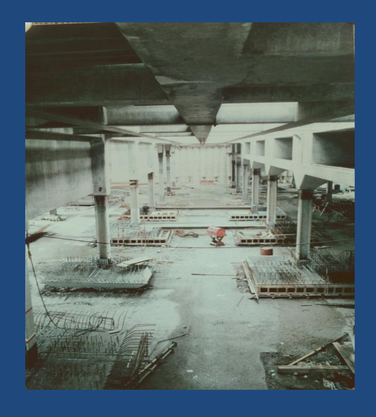
Bullring Shopping Centre